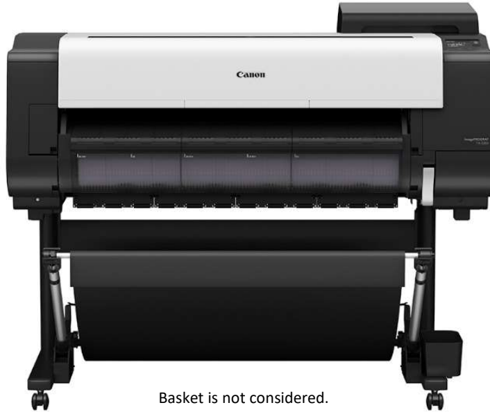
Basket is not considered.