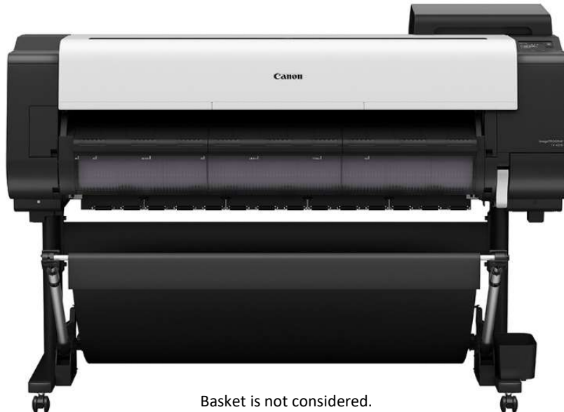
Basket is not considered.