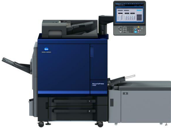
Photo:Option-unit is mounted