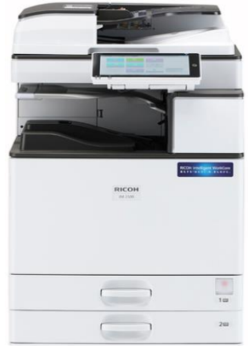
XADF is not included in LCA